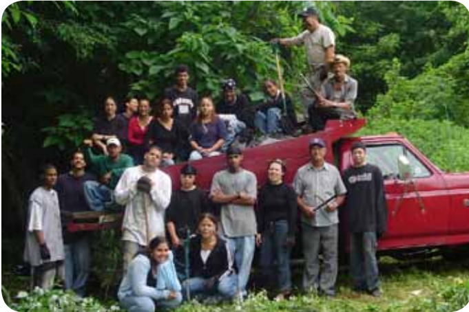
Nuestras Raíces: Local volunteers work to transform a polluted and unused plot of land into a community garden for shared growing and harvesting of fresh, healthy and sustainable products.

experts have found that motivating individuals to act on just one of these indicators can have a profound effect on increasing the quality and years of healthy life, and on eliminating health disparities for both the individual and the community.