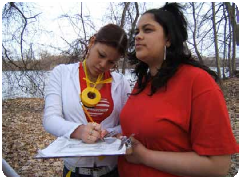
Nuestras Raíces: Teens evaluating project goals for farming and community gardens in Holyoke, Massachusetts.

Although some projects will undergo a process of outside evaluation, all projects will find value through self-evaluation. University partners, in particular, typically have a great deal of experience in developing and implementing evaluation plans and may be able to offer researchers or graduate students who would be eager for opportunities to participate in community evaluations.