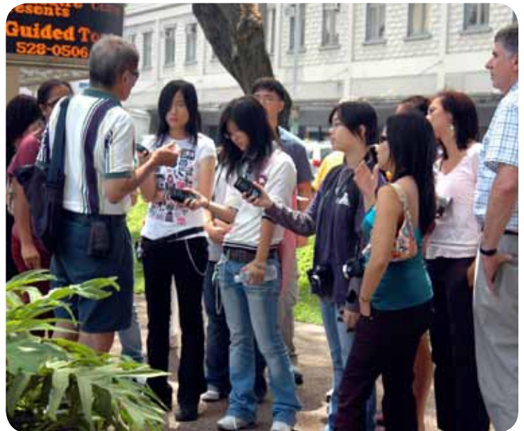
The ARTS at Mark’s Garage: Teens conduct interviews on a tour about the cultural, social and economic landscape of Honolulu.

To reach beyond the four general questions, the CDC developed an additional 10-item set of health perception and activity limitation questions including measures for pain, depression, anxiety, sleeplessness, and vitality. The Core Healthy Days Measures, along with the expanded health perception questions, can be found in the CDC’s “Measuring Healthy Days” report (see Resources on p. 52, for information on this report, and other publications, that provide tips for developing health surveys). “Use of the expanded set of questions,” the report states, “may be one of the most cost-effective ways of assessing the population need, or susceptibility for, health services, disease incidence, and death.