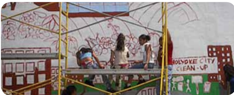
Nuestras Raíces: Youth painting a mural showcasing the city of Holyoke's clean-up program activities.

When The Robert Wood Johnson Foundation supported an initiative to improve end-of-life care, community organizations were required to work together in partnership and form a coalition. Hospitals, hospices, nursing homes, universities, and other organizations with an interest and stake in the issue worked alongside individuals from the community to develop and implement a series of successful strategies.