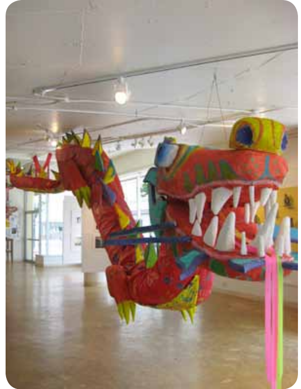
The ARTS at Marks Garage: The Hawai'i Arts Alliance founded a collaborative gallery, performance and office space for businesses and non-profit organizations aiming to transform downtown Honolulu with the power of the arts.

Finally, at any stage of the process, it is important to collect and share the existing knowledge held by team members so that every effort can be maximized. Together, a team of community partners, with its collective experience, possesses a wealth of knowledge that is hard to rival. The team should always be thinking about how it can leverage this strength and channel it into each of its endeavors. ■