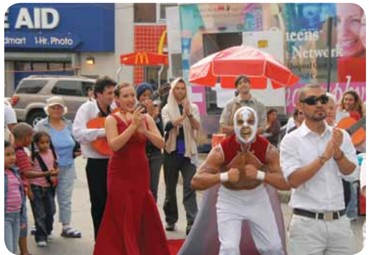
The Queens Museum of Art: El Conquistador prepared to enter the ring in Corona Plaza, Queens, for his final performance as part of the Queens Museum of Art's public art project, Corona Plaza: Center of Everywhere.

Just as when developing an outcomes evaluation plan, all partners in the coalition should take part in planning for process evaluation. The most useful questions will reflect the diversity of all partners' perspectives, key components of the project, the most important information needs, and the resources available to answer the questions.