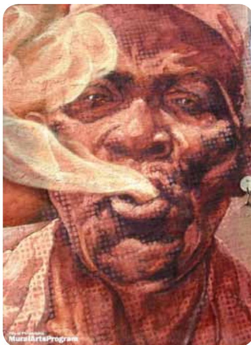
Mural Arts Program: The message of this mural is to depict the adverse effects of second-hand smoke on children, pregnant women and the elderly.