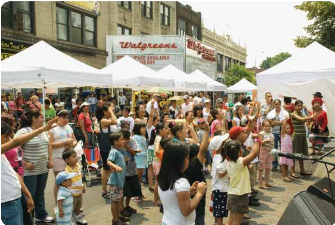
The Queens Museum of Art: Members of the community outside of the Corona National Community Center participating in a fundraising event for The Heart of Corona Initiative .

Arts Organizations and Public Health identifies best practices of diverse arts organizations from around the United States to inform this work. The best practices can be used as references, and are cited throughout the publication to correlate with text. Further information for all of the organizations mentioned can be found at the end of the publication.