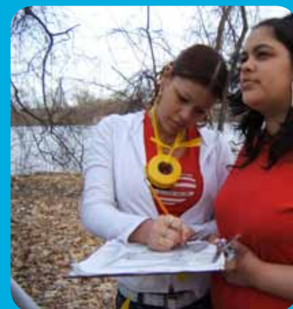
Above photos: (left) Nuestras Raíces : Youth planting in the community garden; (middle) Mural Arts Program : The Evolving Face of Nursing; (right) Nuestras Raíces . Teens evaluating project goals.