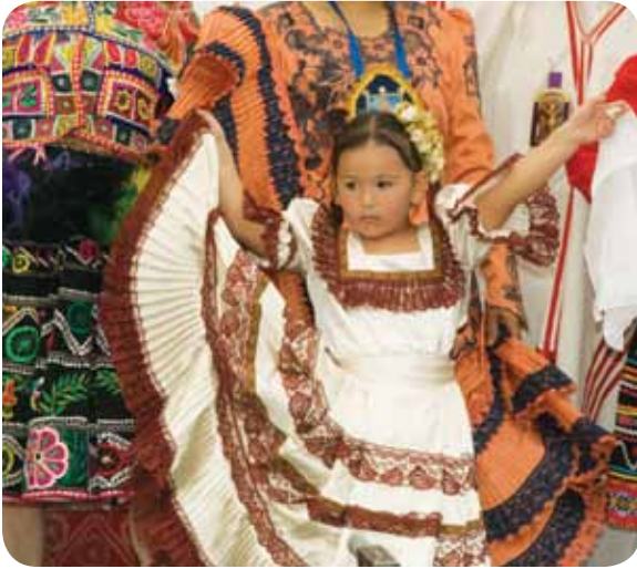
The Queens Museum of Art: Young girl dressed in traditional Latin American dress during The Heart of Corona Initiative .