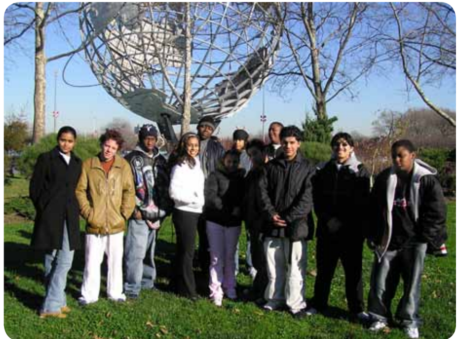
The Queens Museum of Art: Youth volunteers in front of the World's Fair Globe.